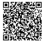
Pervious Paving Factsheet

Pervious surfaces can be used in driveways, backyards, and walkways. Pervious surfaces include the following: pervious concrete or porous asphalt, grid pavers with gaps filled with gravel or turf, interlocking pavers made of pervious material, and solid interlocking pavers that have gaps between them. For design guidance, see the Pervious Pavement Fact Sheet .